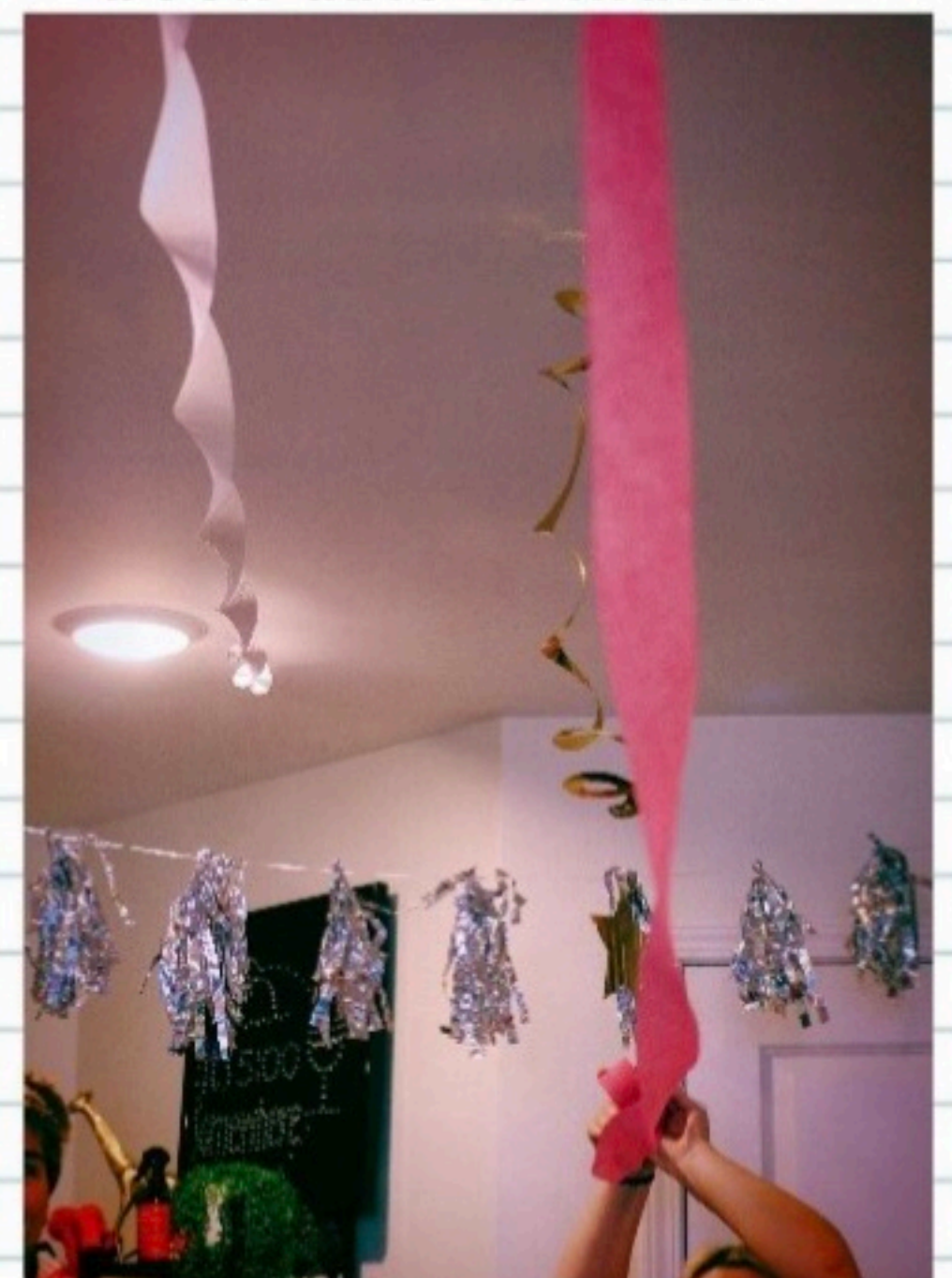
*Pictured: decorating for a friend's birthday party